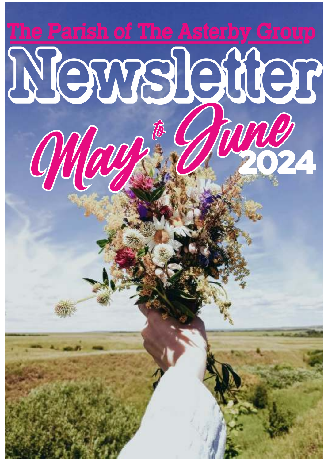
All information contained within this newsletter is assumed correct at time of publication.