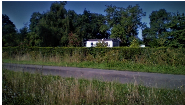
Mobile home £50,000